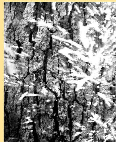
Overlapping and experimenting with Photoshop