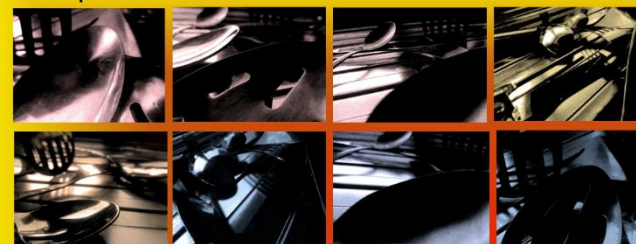
I like how I edit these photo with the different colours and the black in the photos. I picked these photos because the colour go into them.