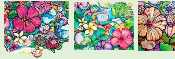
Scarpace (black and white)