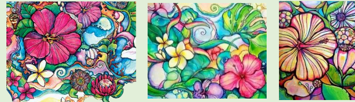
Scarpace (black and white)