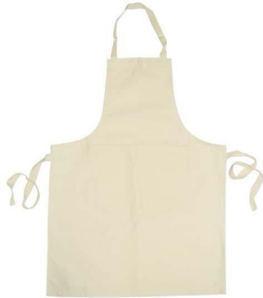
Woodwork/Craft Apron (any colour)