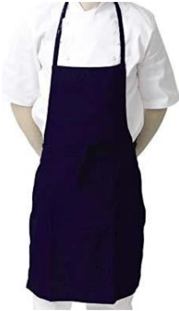
Cookery Apron (any colour)